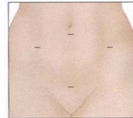
Possible incision sites

The surgery is done using 3 or 4 small incision. These may be made near the naval or along the waistline or pubic hairline. Each incision is about half an inch long or less. Incisions may be vertical or horizontal.