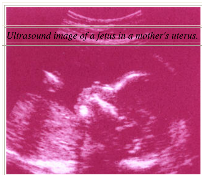
Ultrasound image of a fetus in a mother's uterus.

Ultrasound is used to look for problems that may occur or to check on the progress of your pregnancy. It can be a useful tool, especially when used with other tests and exams.