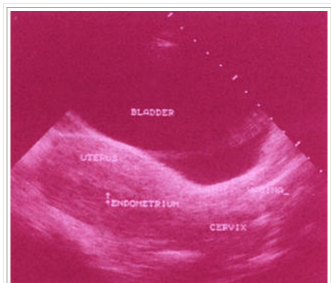
Ultrasound image of the pelvic organs.